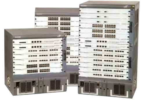
from left: 3Com Switch 8807, Switch 8810, Switch 8814

A high-performance, multilayer modular switching platform for the most demanding Enterprise environments, driving secure, non-stop delivery of business applications