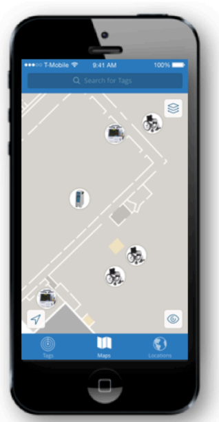
Locating assets on a mobile device

Functionality is included in an SDK for both iOS and Android operating systems. A Web SDK is also provided for visualization in a web browser.